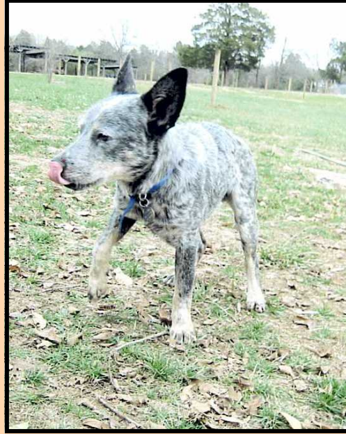
Vinnie was rescued by Tennessee Valley ACD Rescue from a Georgia shelter. We all know ACDs who will eat just about anything, and Vinnie was no exception! ACDRI contributed funds for surgery to remove blockage from an ingested towel. Vinnie has recovered fully and is happily enjoying life as a healthy boy!