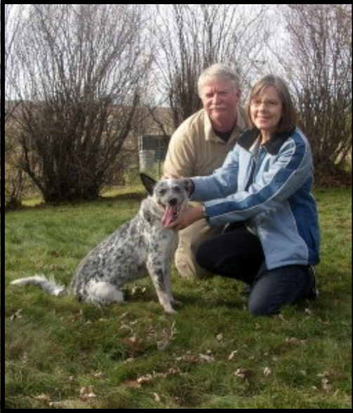
Meeka and her new family on adoption day, after being left behind in a shelter overnight dropoff box.